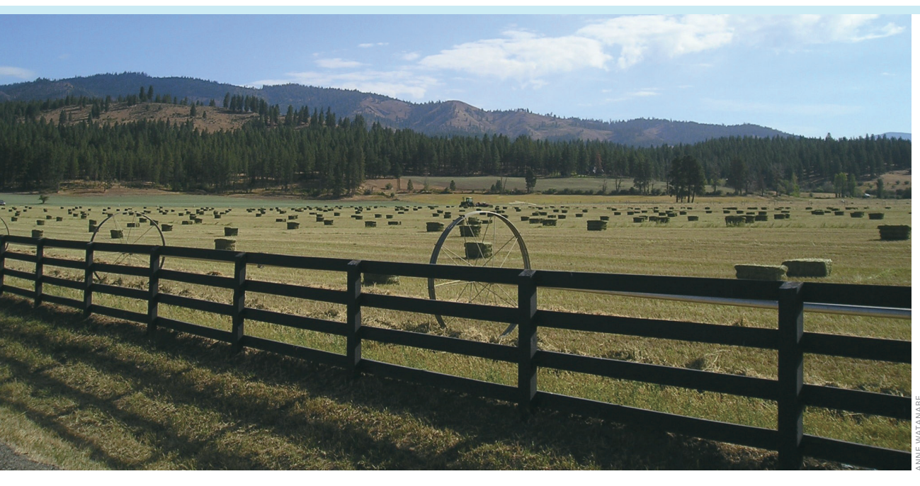
Good planning for future growth will help Forterra keep the impact of housing to a minimum for prime farmland in Kittitas County, Washington.

open space plan were reconvened, residents were ready to talk about what they had experienced during the flood and how to make sure it never happened again. The final public meeting was held in the farmers' market in the fall, only a week after the market had reopened after the massive cleanup. By co-convening these meetings with the city, the Land Trust for Tennessee was able to reshape the agenda for conservation and future development, and have a major impact.